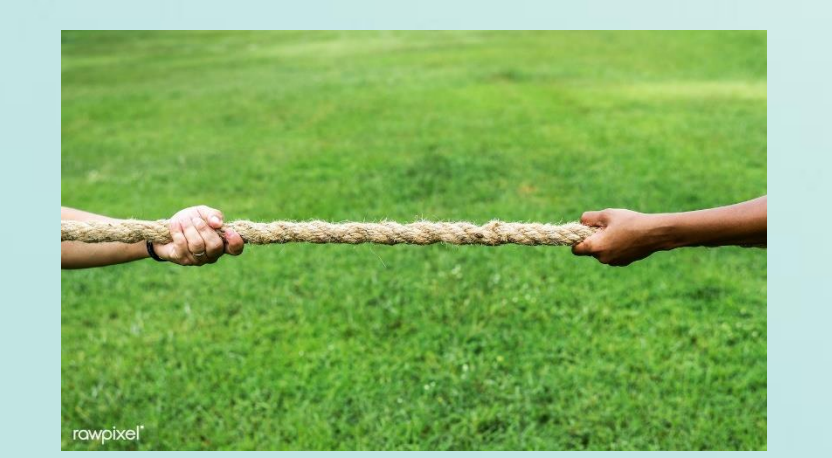
Tug a War