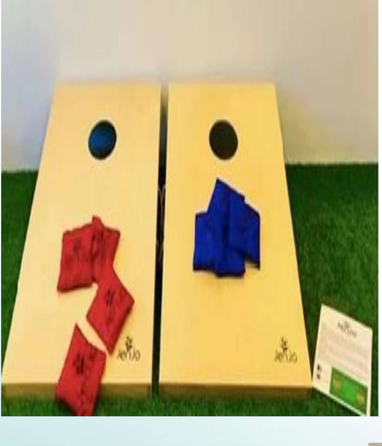
Giant Sack Toss