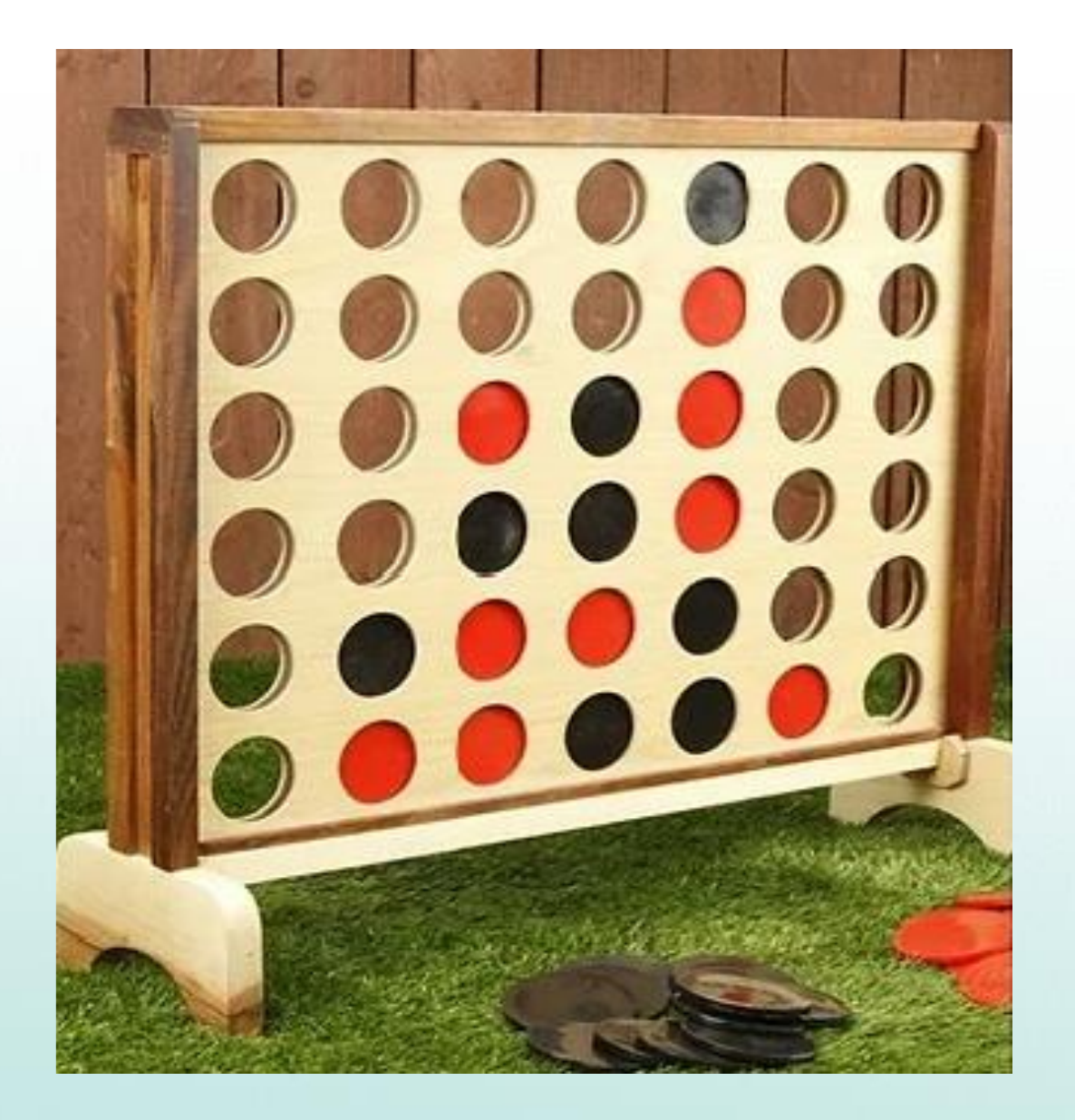
Giant Connect 4